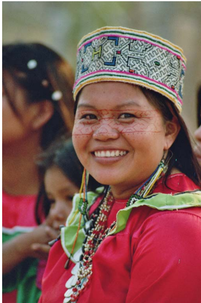
FIGURE 1. The pattern art of Shipibo women

so that the Shipibo depend on money exclusively. Men support their families of ten to fifteen with occasional jobs in the woodworking industry. Young men have discovered that shaman work is one of the few well-paid sources of extra income. Women have become the main bread-winners selling exceptionally pretty handicraft.