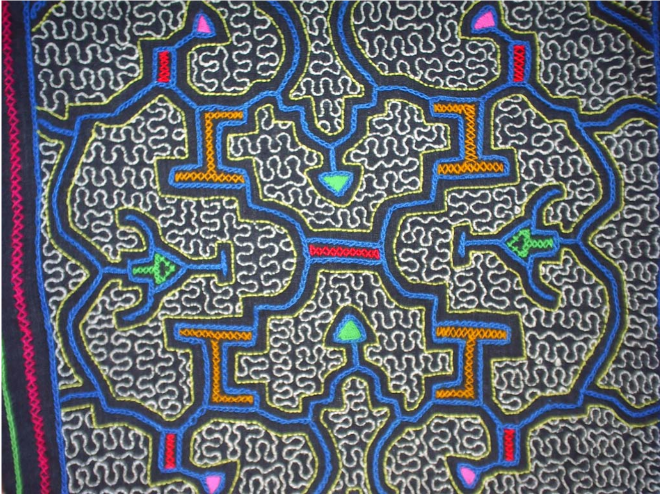
FIGURE 11. Traditional patterns embroidered by Shipibo women are songs, are painted music

The second icaro of the night involves all participants in the ritual and asks for their well-being. After three to four more general songs the shaman asks one of the patients to come near. Then he sings very specific icaros for that person that arise from his synaesthetic perceptions, visions and auditions (acoustic hallucinations).