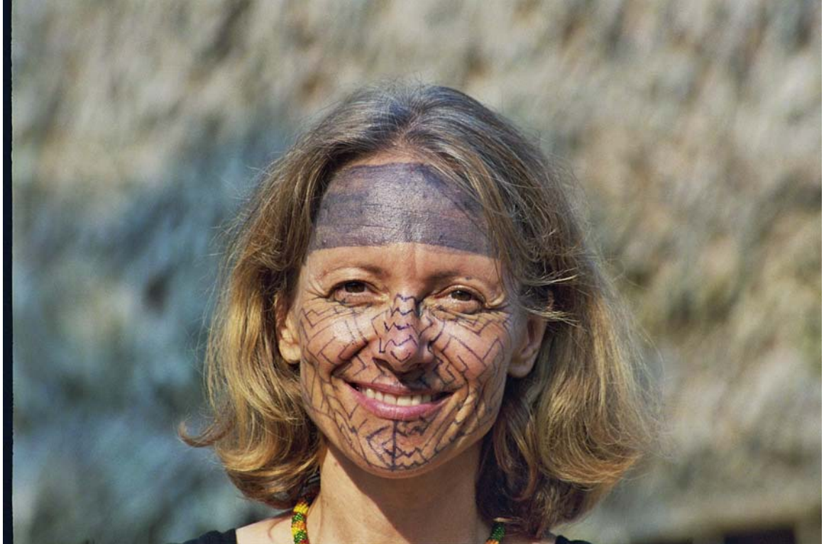
FIGURE 16. A farewell present of friendship: Protective energy patterns for the author that unfortunately faded away after two weeks.