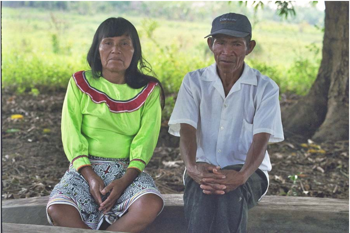
FIGURE 9. Shipobo shaman with his woman the tabaquera