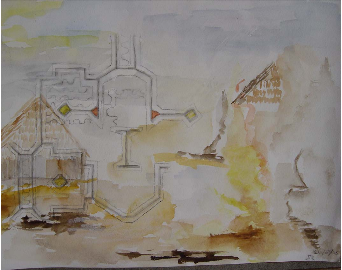
FIGURE 14. Photo No. 16 Forest in flames – clearing land by fire near the village