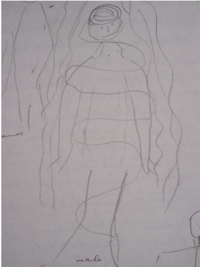
FIGURE 12. Impaired body surrounded by harmful nihue mis